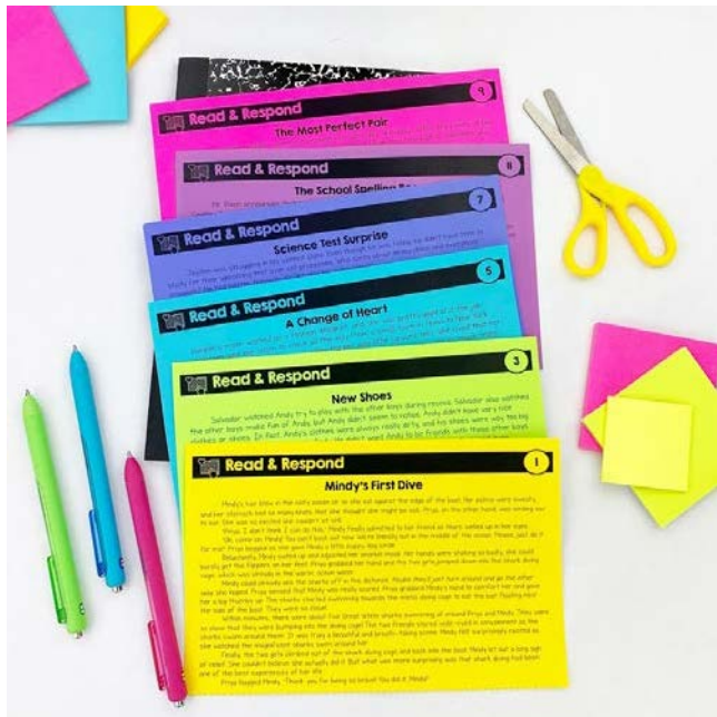
Option #1 - Just the text

Task cards can be printed in three different ways.