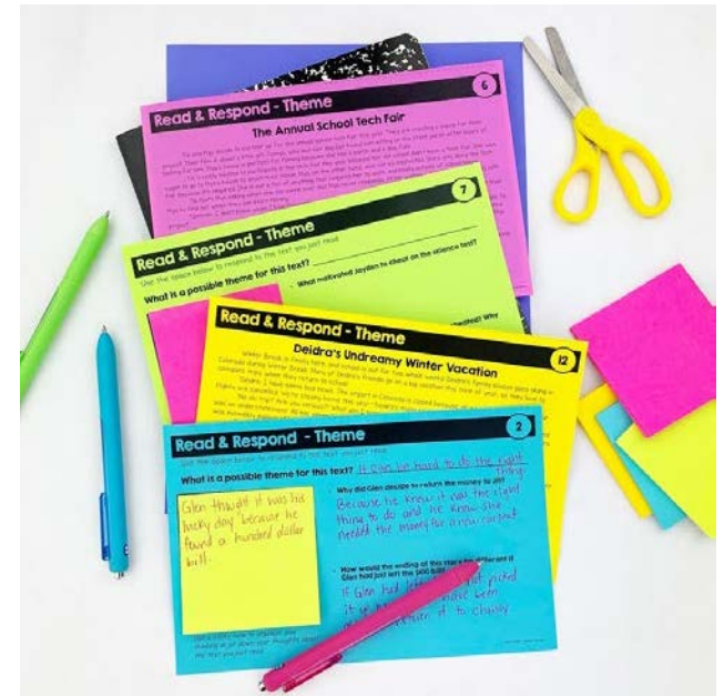
Option #3 - Text and Response Questions

*Digital versions are included for all three sets of task cards.*