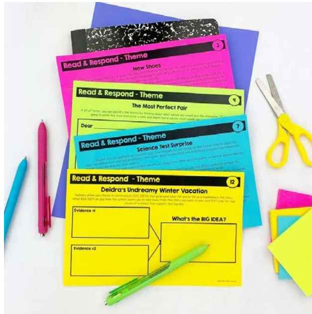
Option #2 - Text and Graphic Organizer Template