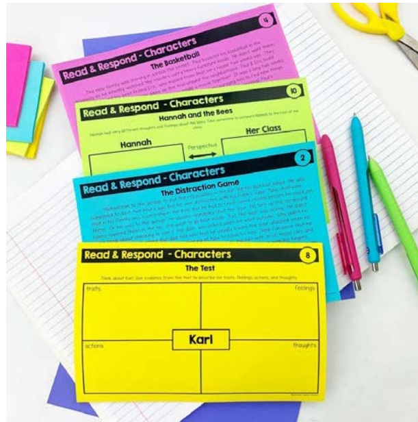
Option #2 - Text and Graphic Organizer Template