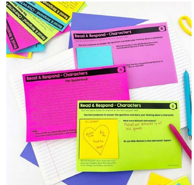
Option #3 - Text and Response Questions

*Digital versions are included for all three sets of task cards.*