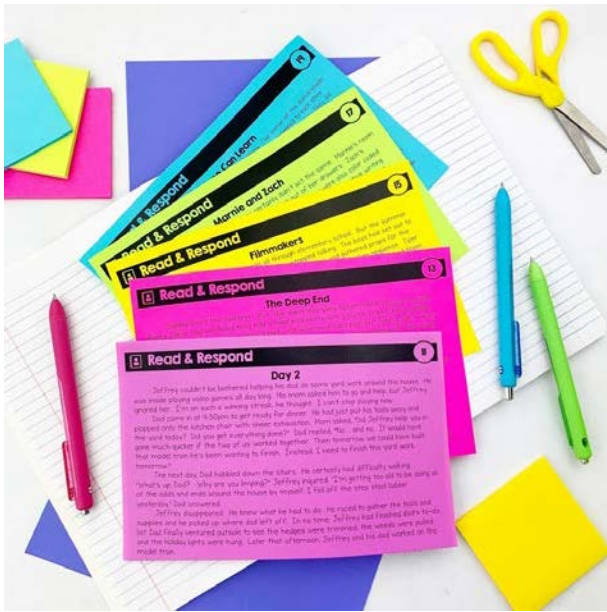
Option #1 - Just the text

Task cards can be printed in three different ways.